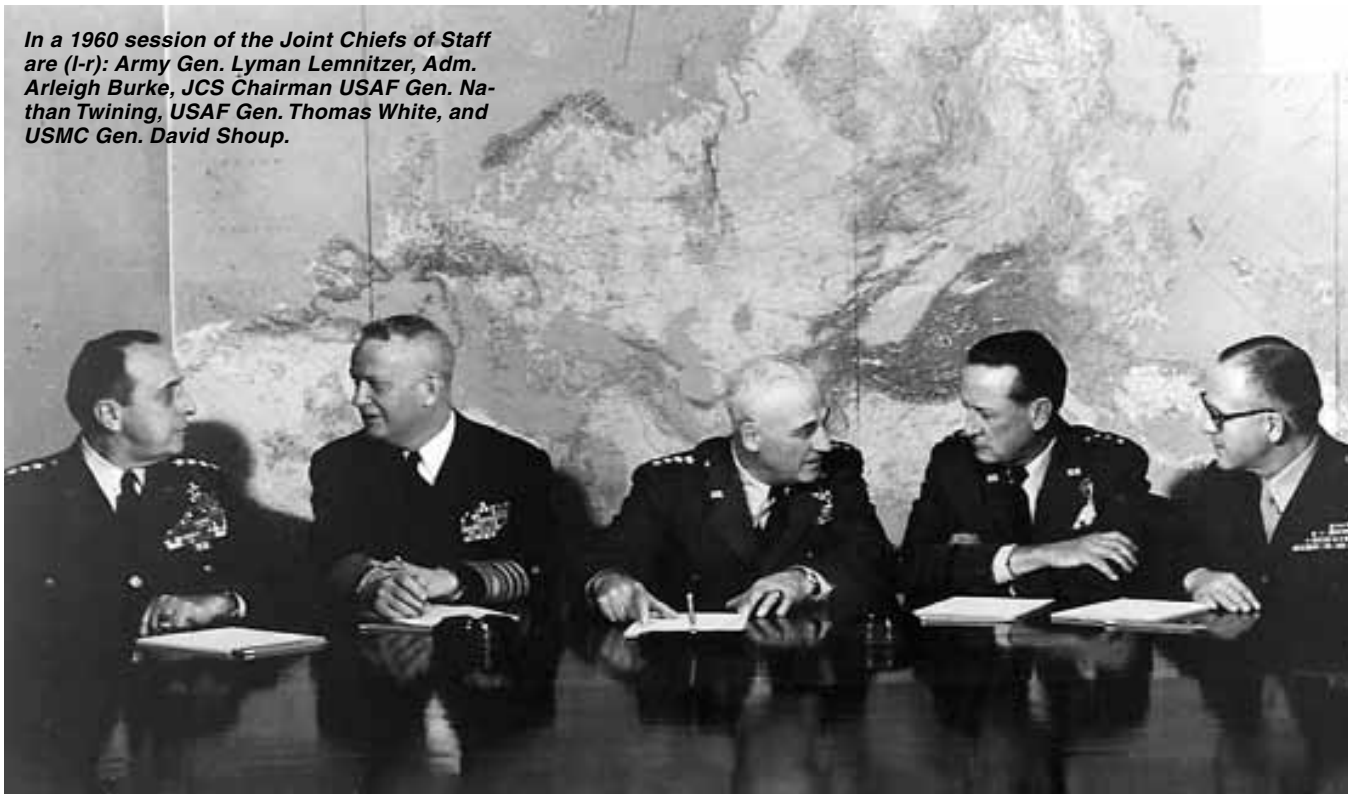
In a 1960 session of the Joint Chiefs of Staff are (l-r): Army Gen. Lyman Lemnitzer, Adm. Arleigh Burke, JCS Chairman USAF Gen. Nathan Twining, USAF Gen. Thomas White, and USMC Gen. David Shoup.