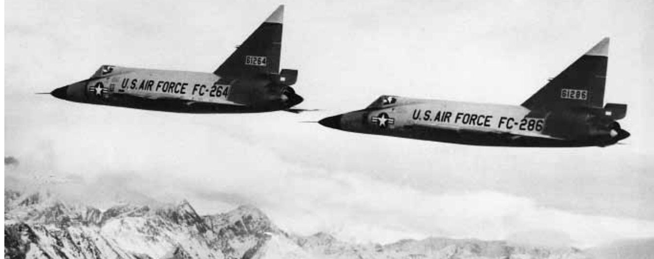
F-102s maintained 24-hour alert status with Alaskan Air Command in 1960.

Established as Bolling Field Command (1946). Redesignated Headquarters Command, USAF, March 17, 1958. Inactivated 1976.