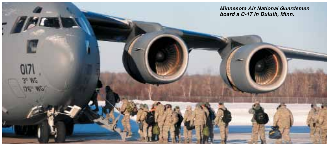
Minnesota Air National Guardsmen board a C-17 in Duluth, Minn.